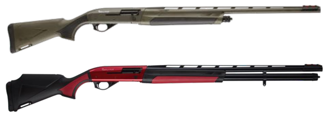
Barrel lengths for high ribs are 24",26",28",30",32" Barrel lengths for slugs & rifle are 18,5", 20", 22", 24"

Impala Plus is a 12 Gauge, 3" chambered inertia semi auto shotgun with several innovative features. Magazine capacity is 4+1 and there is 10+1 models available. 10+1 models has a single piece magazine tube, there is no magazine extension.