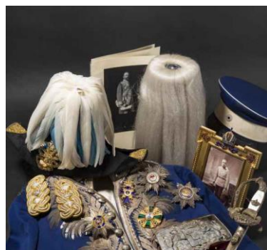
The Barons of Leonrod – their unique estate.