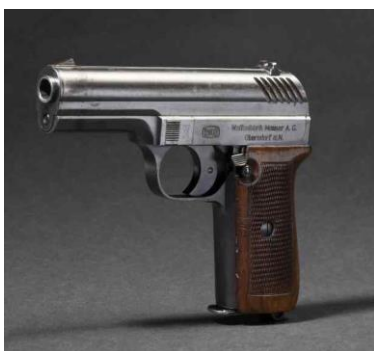
Mauser Nickl prototype pistol. All parts with matching numbers.