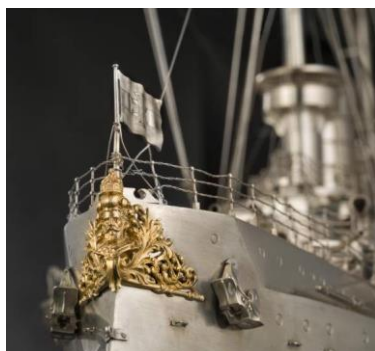
Prince Heinrich of Prussia (1862 - 1929) - silver model SMS Kaiser Friedrich III.