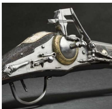
Radschlosspuffer für Offiziere der Leibtrabanten Dresden, datiert 1587.