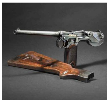
Borchardt C 93, Loewe Berlin, with shoulder stock, circa 1895.