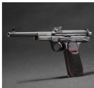
Extremely rare collector's item - Schwarzlose Mod. 1898.