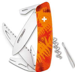
SWIZA TT05 TICK TOOL KNI.0090.2060

The SWIZA TT05 TICK TOOL is equipped with 12 functions.