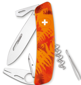
SWIZA TT03 TICK TOOL KNI.0070.2060

The new SWIZA TICK TOOL will be available in two versions at all SWIZA points of sale or via our online shop, www.swiza.com .