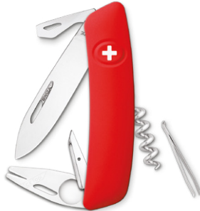
SWIZA TT03 TICK TOOL KNI.0070.1000