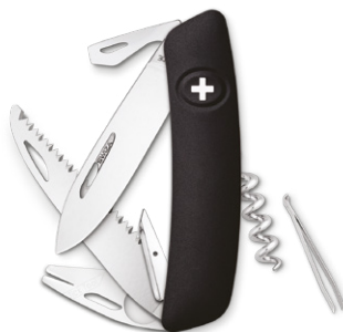
SWIZA TT05 TICK TOOL KNI.0090.1010