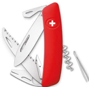
SWIZA TT05 TICK TOOL KNI.0090.1000