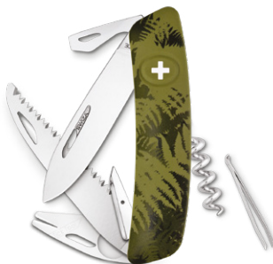
SWIZA TT05 TICK TOOL KNI.0090.2050