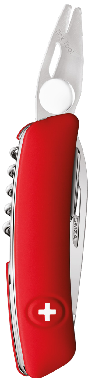
SWIZA TT03 TICK TOOL

Known for leading with innovative designs and cutting-edge products, SWIZA introduces the new SWIZA TICK TOOL. With a pending patent, this is the first Swiss Knife that includes a tool specifically designed to remove ticks. Because the urban rebel isn't confined to the city.