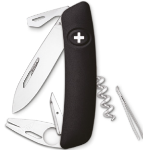
SWIZA TT03 TICK TOOL KNI.0070.1010