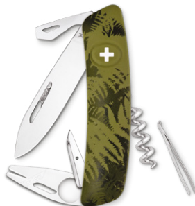
SWIZA TT03 TICK TOOL KNI.0070.2050