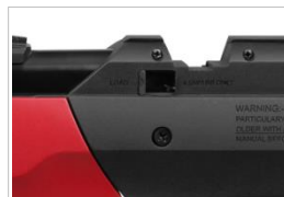
Reservoir holding up to 40 steel BBs