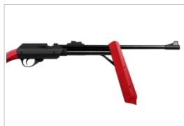
Forearm for pump strokes