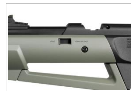
Reservoir holding up to 60 steel BBs

* Available in lowered maximum velocities for select countries