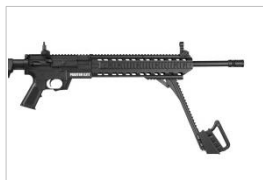
Ergonomic grip for easier pump strokes (patent pending)