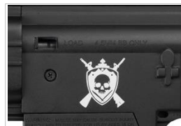
Reservoir holding up to 80 steel BBs