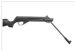
3 in 1 adjustable BufferTech stock (patent pending)