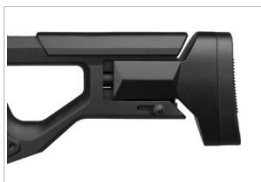
3 in 1 adjustable BufferTech stock (patent pending)

* Available in lowered maximum velocities for select countries