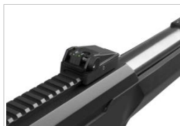
Fiber optic rear sight