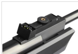
Fiber optic rear sight

* Available in lowered maximum velocities for select countries