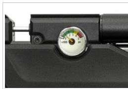
Built-in pressure gauge