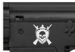
Reservoir holding up to 80 steel BBs