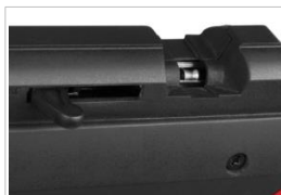
Pellet loading breech