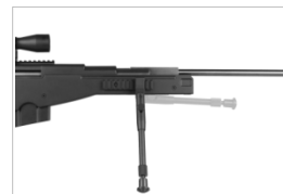
Detachable 9" swivel bipods