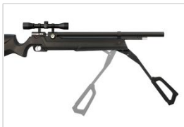
Built-in Multi-stage hand pump design