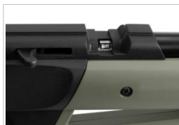
Pellet loading breech