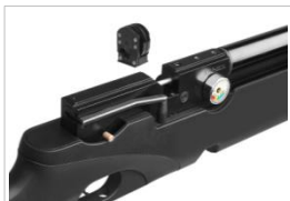
Rotary clip magazine

* Available in lowered maximum velocities for select countries