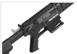
Charging handle for pallet loading