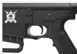
Safety slider and indicator