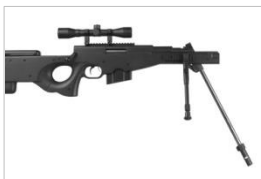
Break barrel mechanism

* Available in lowered maximum velocities for select countries