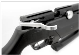
Special lever action bolt design to reduce the strength of bolt pull.