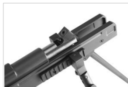
Pellet loading breech