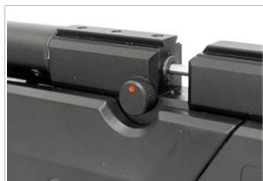
Power adjustment knob (patent pending) allow quick adjustment on the energy output. Minimum power (800 fps) and Maximum power (1000 fps)