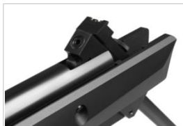
Pellet loading breech