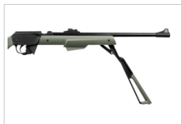
Ergonomic grip for easier pump strokes (patent pending)