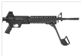
Ergonomic grip for easier pump strokes (patent pending)