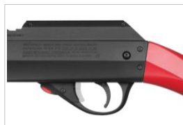
Safety slider and fire / safe indicator