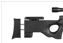
Extendable stock with rubber buttpad