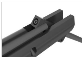
Pellet loading breech