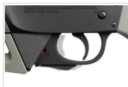
Safety slider and indicator