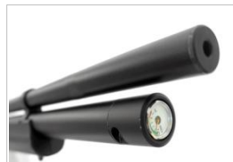
Built-in pressure gauge

Special lever action bolt design to reduce the strength of bolt pull.